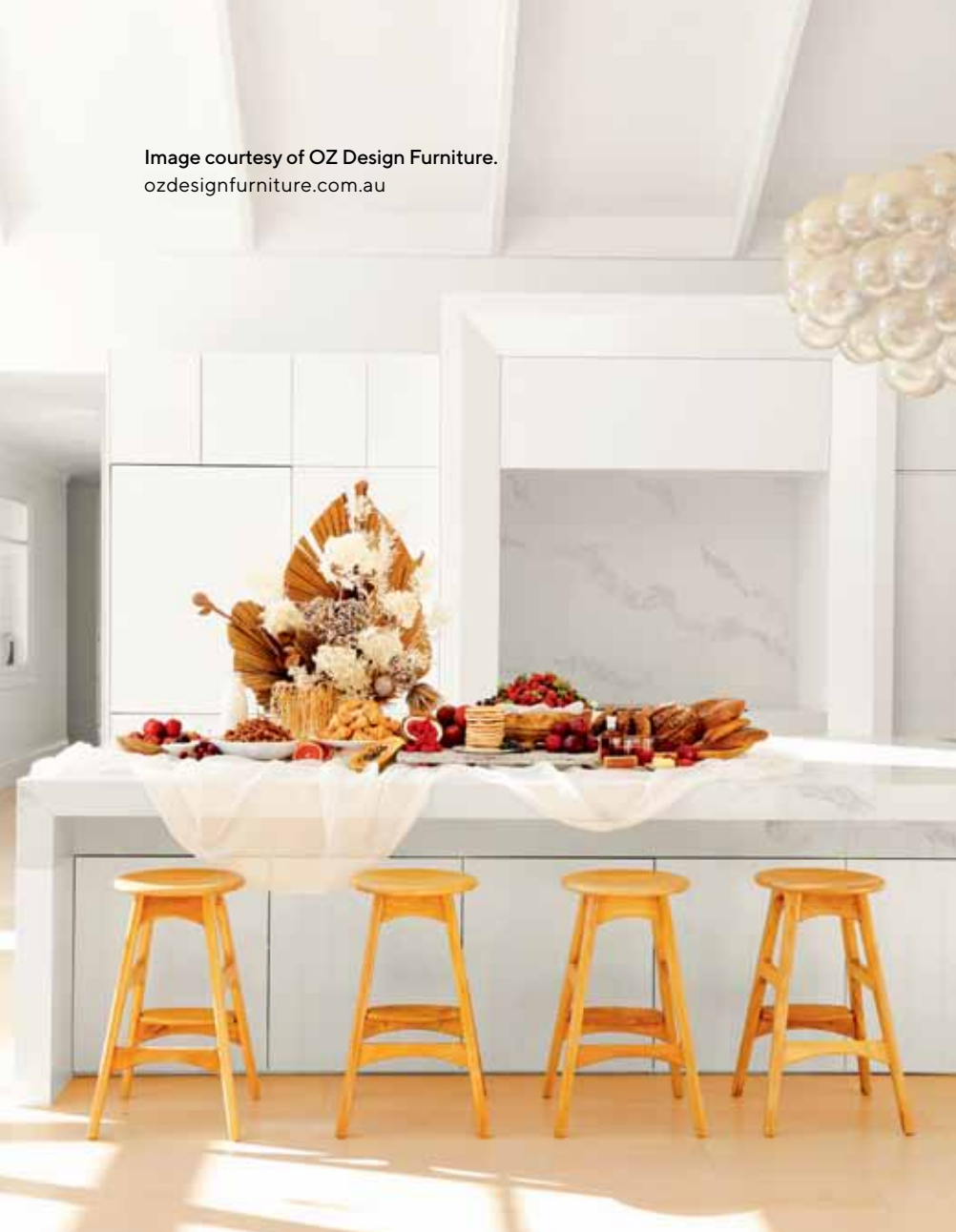
ozdesignfurniture.com.au

K itchens designed with entertaining in mind tend to have a warm and welcoming vibe, plenty of bench space, cosy seating, a few stylish designer touches, and modern appliances to make entertaining a breeze.